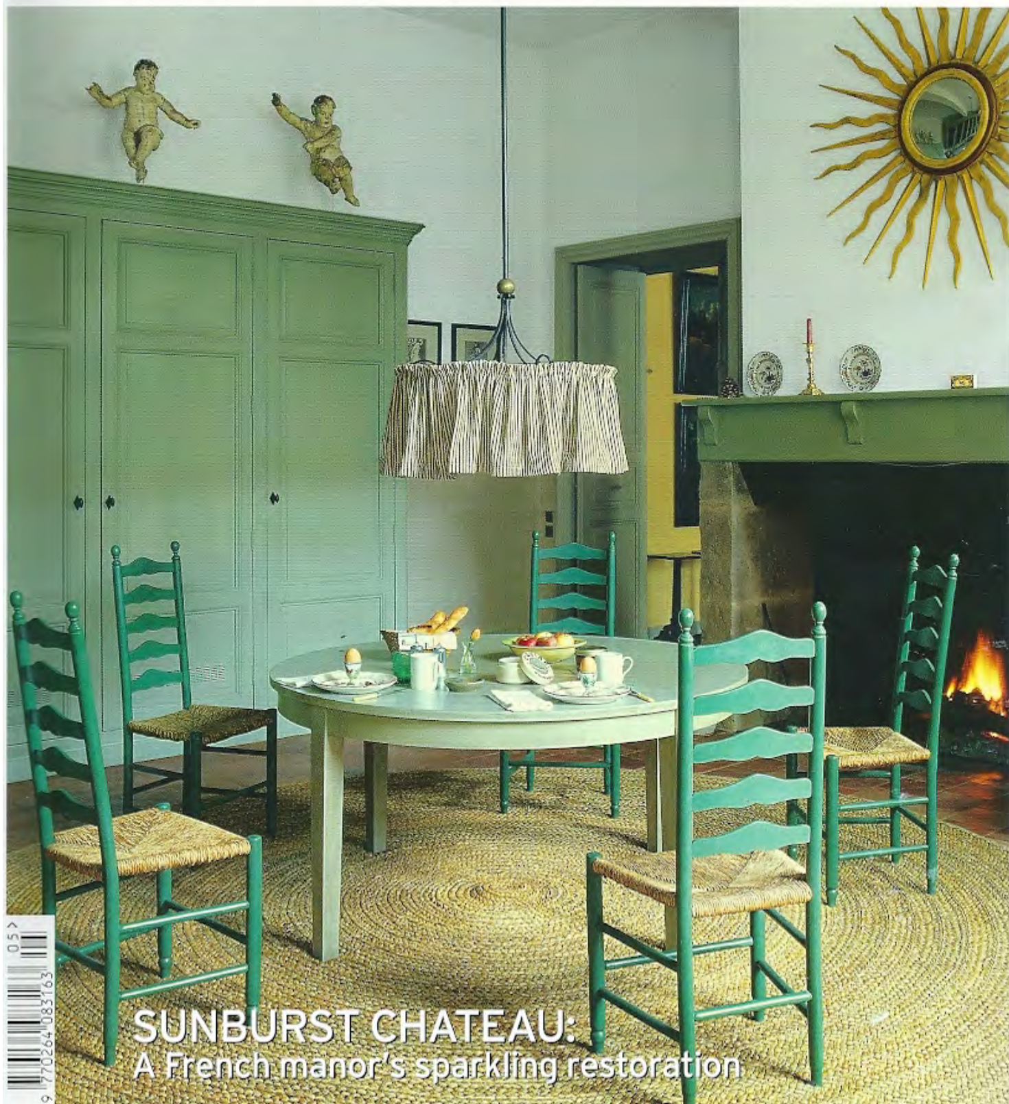
SUNBURST CHATEAU: A French manor's sparkling restoration