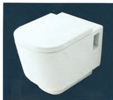
LOOS 1 Classic close-coupled loo and cistern, £1,195.20, Lefroy Brooks. 2 'Il Bagno Alessi Dot' bidet, by Wiel Arets, £756.80; 'Il Bagno Alessi Dot' loo, by Wiel Arets, £883.88; both Laufen. 3 'Chaise Percée', £2,562, The Water Monopoly. 4 Victorian P-trap 'Colonial', c1890, £1,625, Stiffkey Bathrooms. 5 'No. 814' low-level cistern, £595, Thomas Crapper. 6 'John' loo, by Rapsel, £3,448.80; 'Mary' bidet, by Rapsel, £2,643.60; both West One Bathrooms. 7 'Palladio', £945 approx, Volevatch. 8 'Evakuo 21', by Prospero Rasulo, £797 approx, Antonio Lupi. All prices include VAT. For suppliers' details see Address Book >